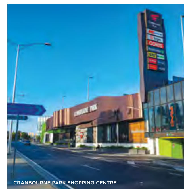
CRANBOURNE PARK SHOPPING CENTRE