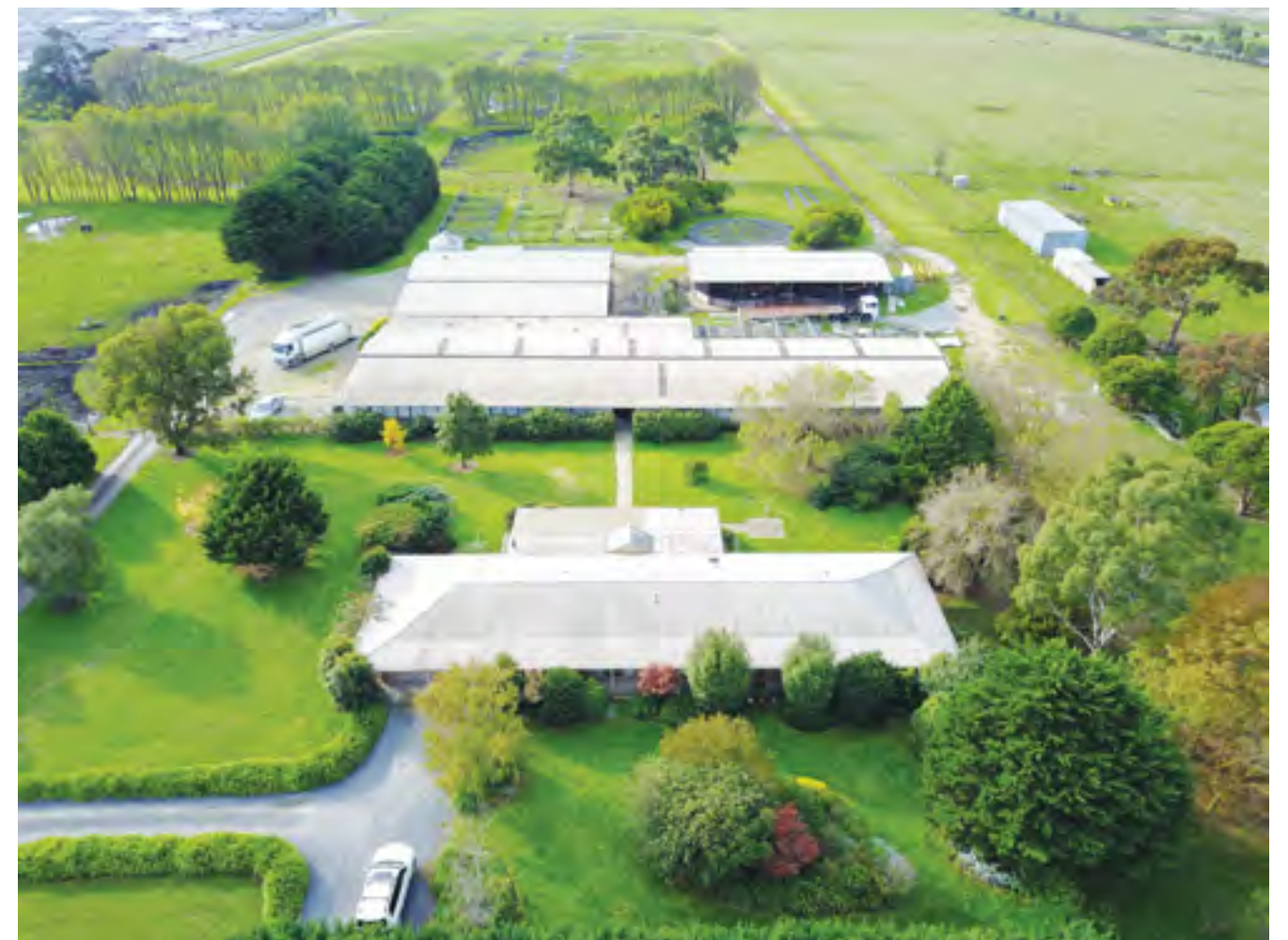
Former Allan Glen Lodge, a horse training facility operated by the Williams family.