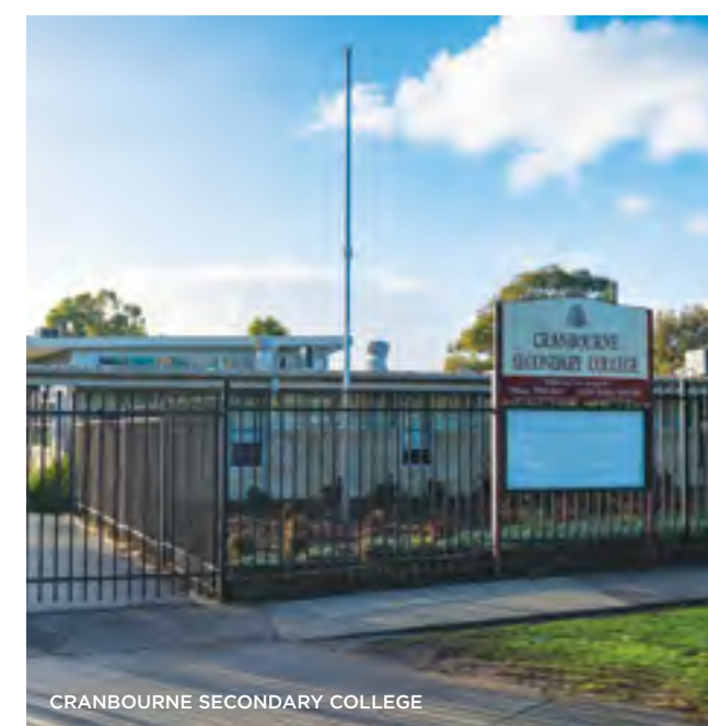
CRANBOURNE SECONDARY COLLEGE