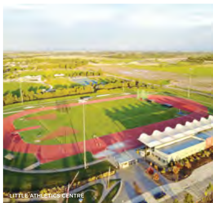
LITTLE ATHLETICS CENTRE